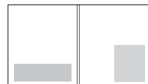
C. 1/4-page | 7.5 x 2.5, 3.75 x 5