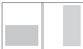
B. 1/2 page | 7.5 x 5, 3.75 x 10