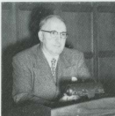
WARREN RESCH, DEPUTY ATTORNEY GENERAL OF WISCONSIN, Speaker at first NOLPE Conference.