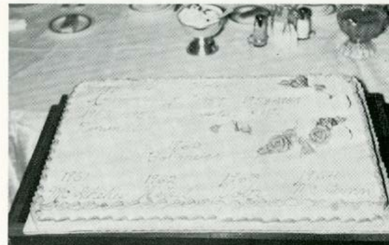
10th Anniversary Cake Cut at 1964 NOLPE Conference Denver, Colorado