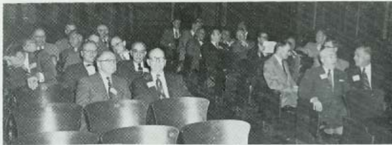
First Annual Conference of NOLPE University of Chicago - November 1955